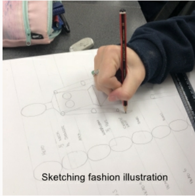
Sketching fashion illustration